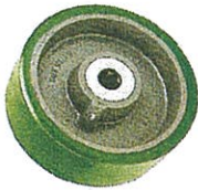
1/2" Polyurethane Coated on Steel Wheels With Bearing Insert Rated at 700 lbs. Part # P4X2X750