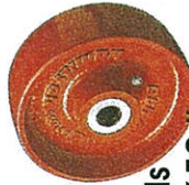
Drop Forged Steel Wheels (c/w Roller Bearings) Rated at 650 lbs. Part # STL4X2X750